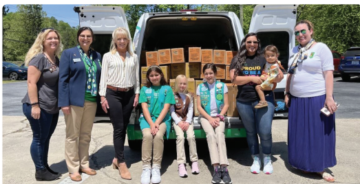
1,200 boxes of Girl Scout Cookies were donated to MANNA FoodBank, which supports 16 counties in western North Carolina.