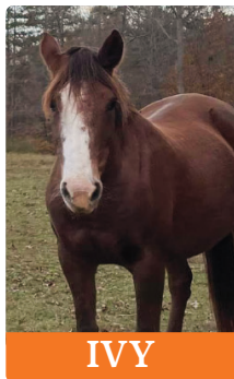
Circle C Equestrian Center welcomed two new horses in 2022. Meet Big Al and Ivy!